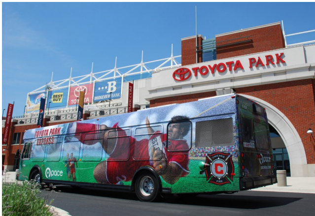
Pace bus at Toyota Park. A Pace Transit Center, a recommendation from the plan, is currently under construction.

This Southwest Conference of Mayors sponsored Harlem Avenue Corridor Plan examined Harlem Avenue from 63rd Street on the north to Interstate 80 on the south, traversing ten suburban communities. Individual sections of the corridor were examined, and site specific recommendations regarding land use, economic development, public transportation, and pedestrian access were identified. Detailed recommendations, including cost estimates, viable funding sources, and potential partnering agencies were provided to address each segment’s unique opportunities. The plan was completed in November 2011 and adopted by the Southwest Conference of Mayors.